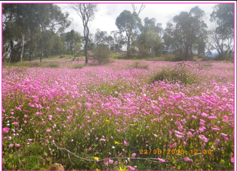
Photo: 2018 Everlasting display at Pelham.

Wednesday, 27 March 2019 saw an announcement of the Federal Government's $70 million commitment through the Roads of Strategic Importance initiative for the Wheatbelt Secondary Freight Route (WSFR). The Deputy Prime Minister Michael McCormack joined representatives of the WSFR in Bindoon to mark the funding announcement. The Deputy Prime Minister, who is also the Minister for Infrastructure, Transport and Regional Development, has been very receptive to what the project group is trying to achieve with the WSFR network. This will fund road improvements which will enhance productivity and driver safety across the Wheatbelt. The WSFR encompasses 80 connecting routes with over 4,400km of roads across the Wheatbelt comprising 42 local governments, the WSFR Working Group has been working for the past three years to secure funding for a project of strategic importance for the agricultural and transport sectors. The announcement brings together the 42 Wheatbelt shires and the Federal Government to identify and prioritise projects across this network in coming months.